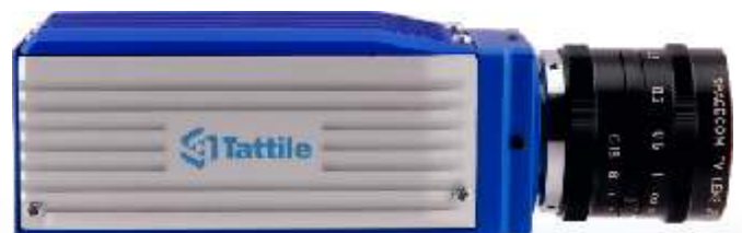
Model TAG - 3, Side View