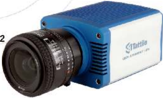
Model TAG - 2 Line Scan